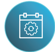
Fewer Routine Service Calls