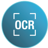
Optical Character Recognition

Higher Duty Cycles and Periodic Maintenance Intervals provide greater volume with fewer routine service calls so you can stay focused on productivity.