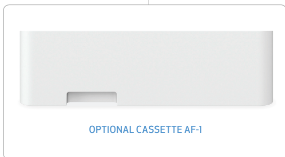
OPTIONAL CASSETTE AF-1