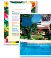
Synthetic Paper 4 (Water-resistant & Durable)